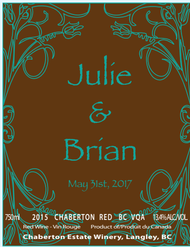
COLOURS CAN BE CHANGED LABEL #213 - TEAL/BROWN FONT: PAPYRUS