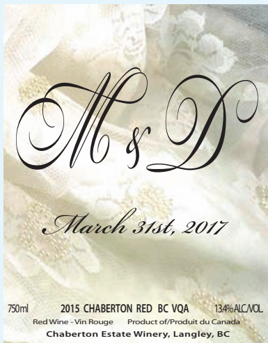
LABEL #215 - LACE FONT: BICKHAM SCRIPT MM SWASH