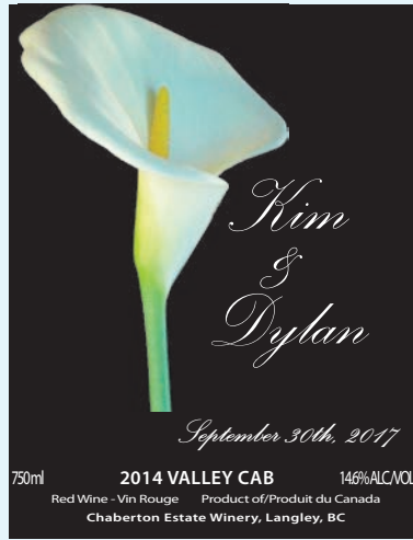
LABEL #214 - CALA LILY FONT: PALACE SCRIPT MT