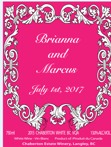
BACKGROUND COLOUR CAN BE CHANGED LABEL #216 - CREST FONT: SNELL ROUNDHOUSE SCRIPT